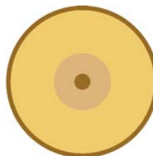
Normal urethral muscle tone

Loss of urethral muscle tone can result in urinary incontinence.