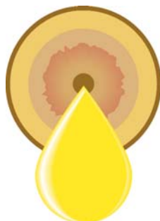
Decreased urethral muscle tone

Loss of urethral muscle tone can result in urinary incontinence.